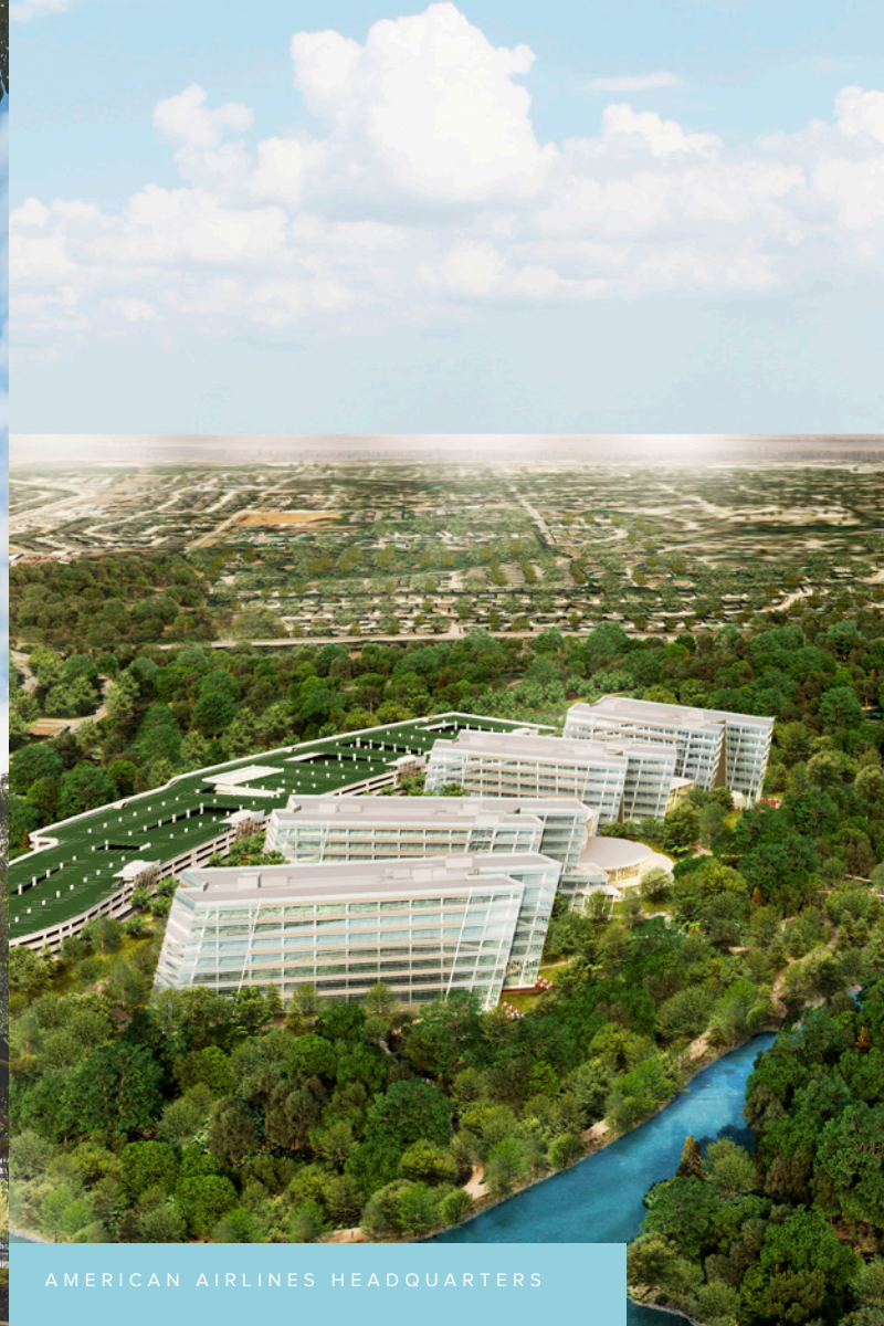
AMERICAN AIRLINES HEADQUARTERS