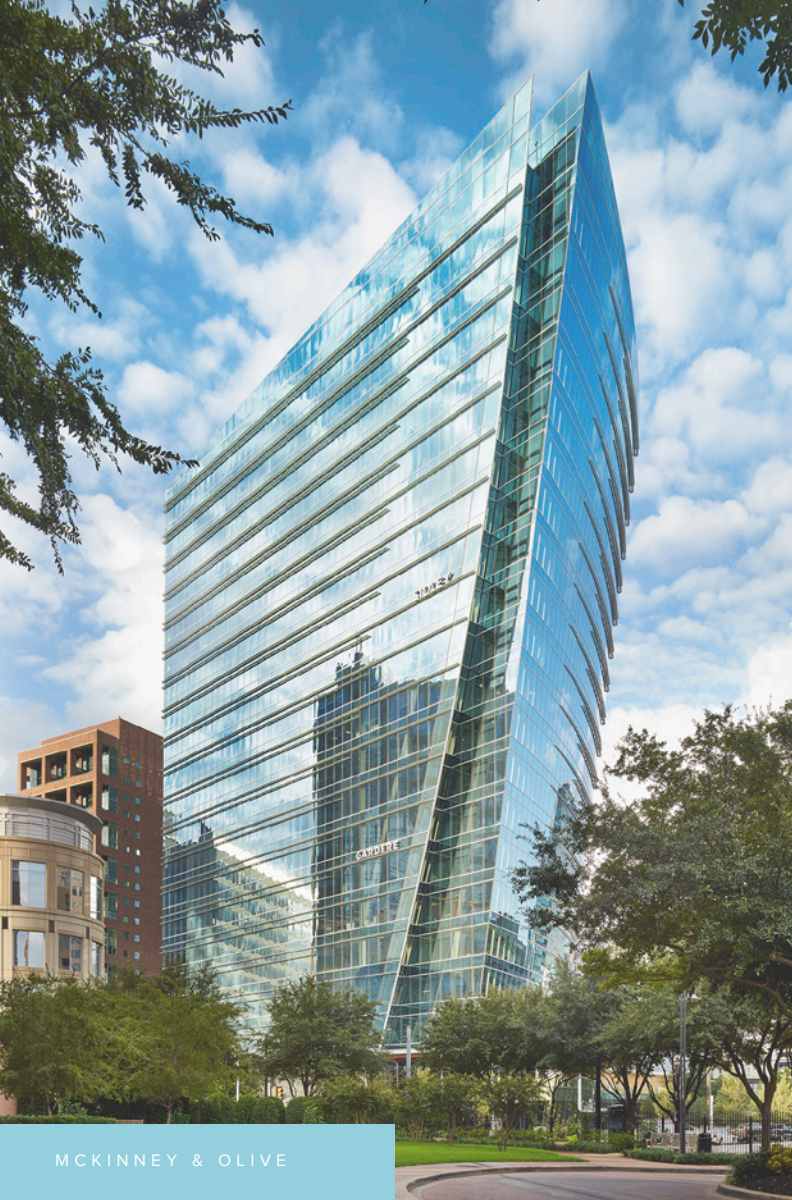
MCKINNEY & OLIVE