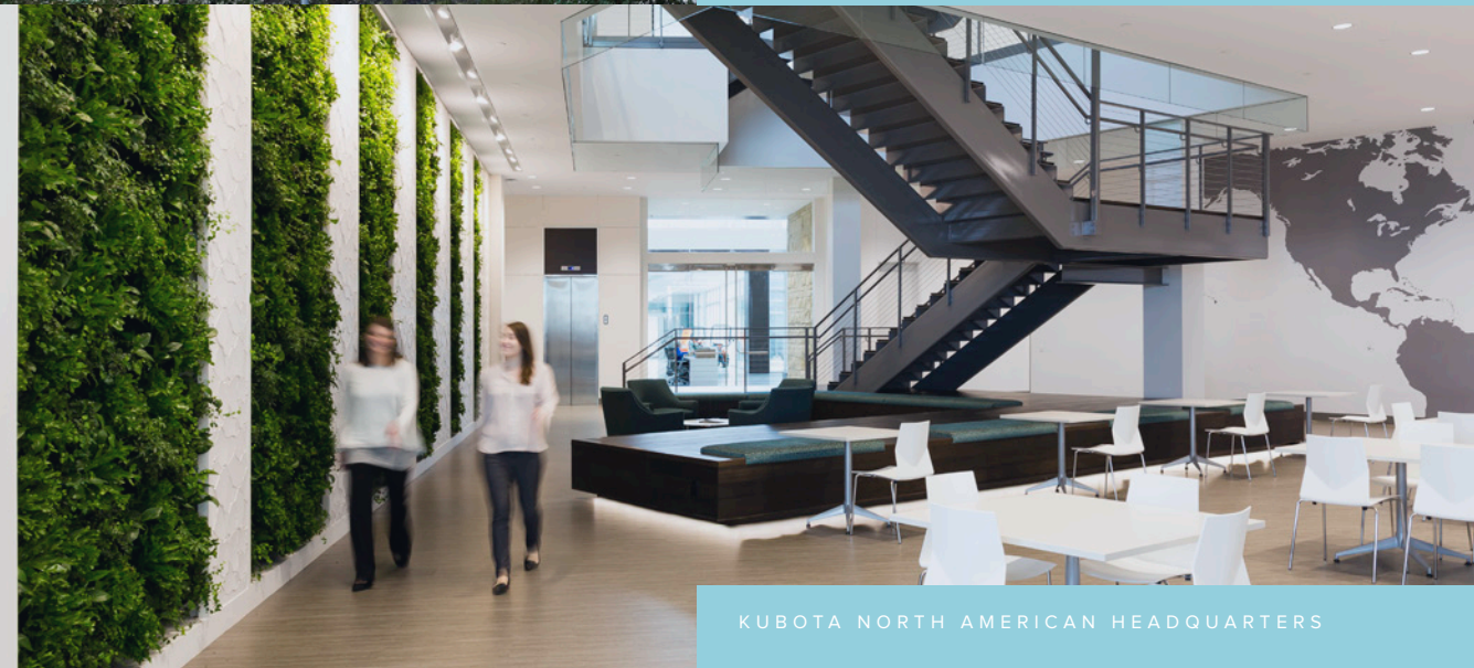
KUBOTA NORTH AMERICAN HEADQUARTERS