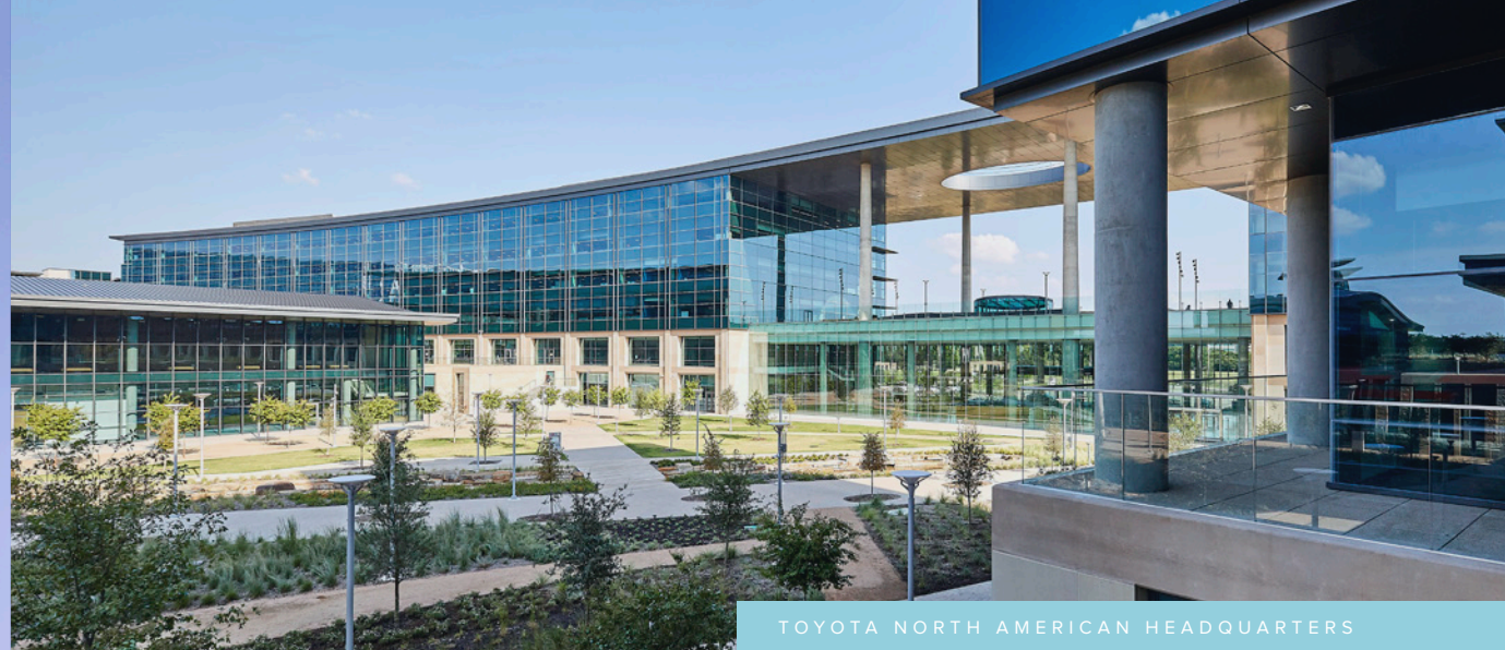
TOYOTA NORTH AMERICAN HEADQUARTERS