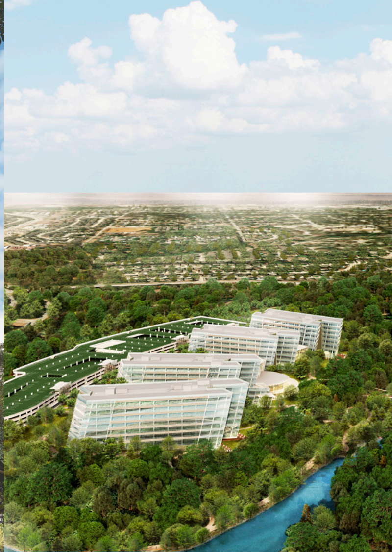
AMERICAN AIRLINES HEADQUARTERS